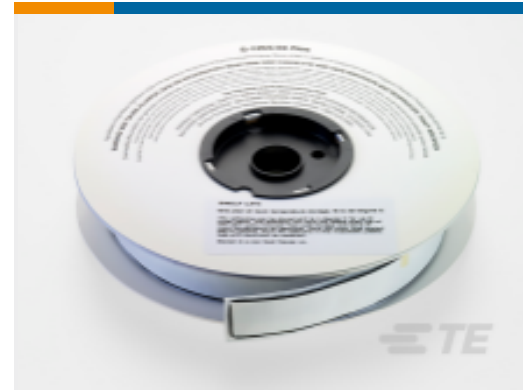
TE Part # 195133-000 S1255-04-3/4X100FT